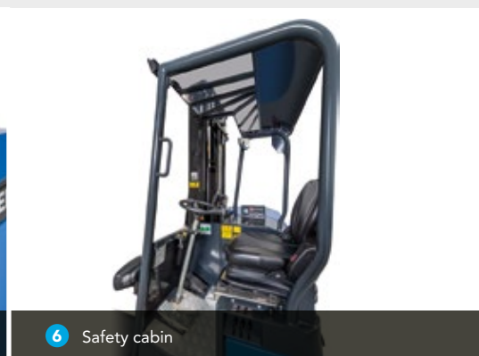
6 Safety cabin