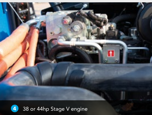
4 38 or 44hp Stage V engine

DGR = Sliding mast, DRS = Roller mast with integrated scissors, DRR = Roller mast