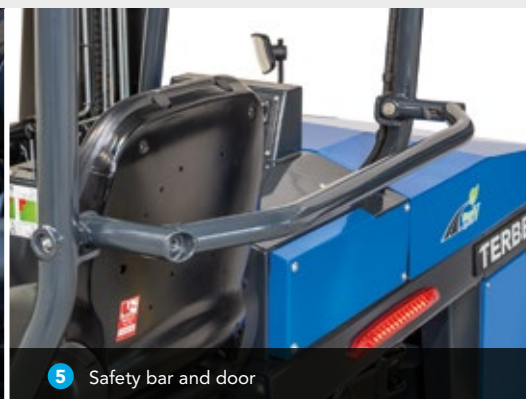
5 Safety bar and door